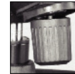
seat tilt tension control