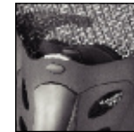
height adjustable and pressure sensitive lumbar support