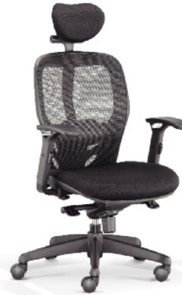
X280 185 77 (as shown) X280 T84 77 (with seat slider)