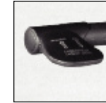
seat height adjustment located on the right side tilt adjustment located on the left side