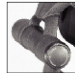
headrest tension adjustment