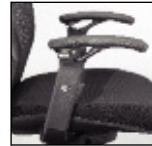
height and width adjustable arms

to blend or contrast with the black mesh back.