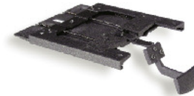
(Optional Seat Slider)