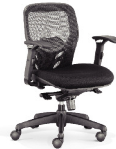
X283 185 77 (as shown) X283 T84 77 (with seat slider)