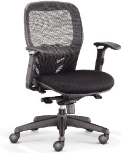
X281 185 77 (as shown) X281 T84 77 (with seat slider)