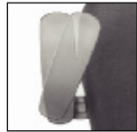
arms have pivoting caps