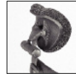
articulating headrest with height and depth adjustment