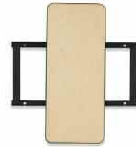
R948 353 77 Suspension