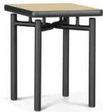
R964 359 77 15" Square