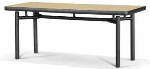
R965 358 77 16.5"x41" Rectangle