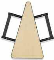
R945 355 77 30° Angle