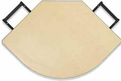
R944 354 77 90° Round Corner