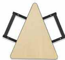
R946 356 77 45° Angle