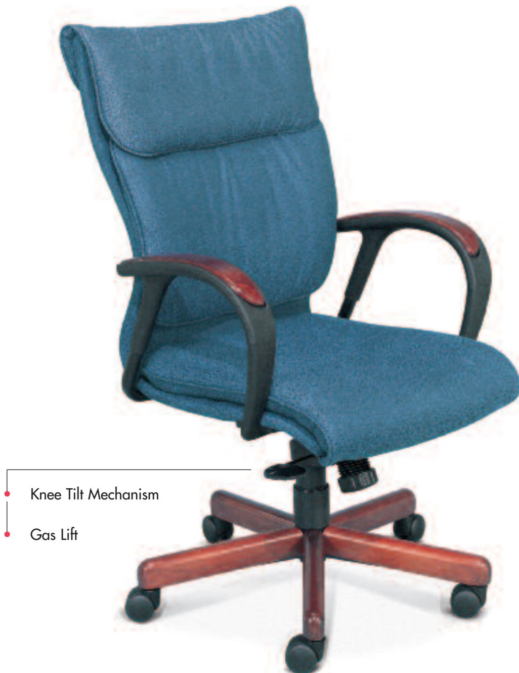
X391 140 AM Executive Chair

W hen Chromcraft created the SOLAS Wood Series, it redefined comfort! Superior comfort and support combined with a tapered, modern wood design define these chairs.