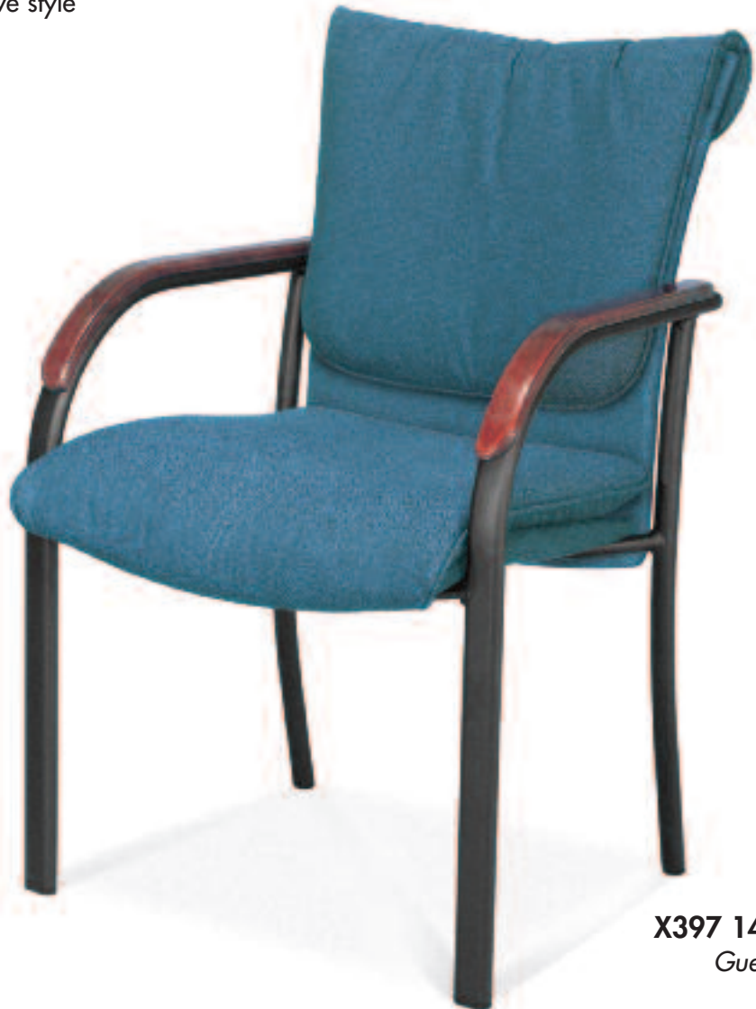
X397 147 77M Guest Chair