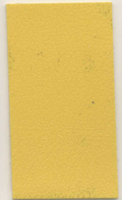
SUN YELLOW 6132