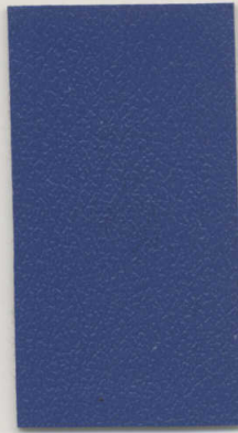
SKY BLUE 6160