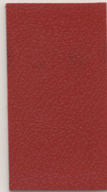
CANDY APPLE 6100