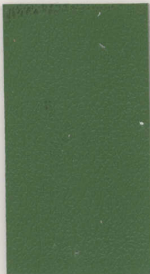
OLIVE GREEN 6123