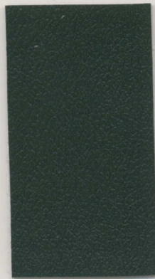
YEW GREEN 6124