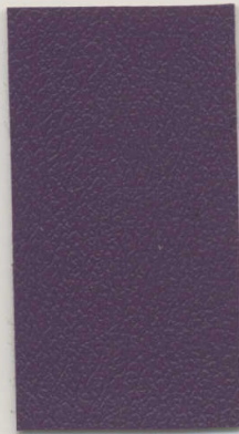
PURPLE IRIS 6191