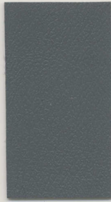
MED. GREY 6183