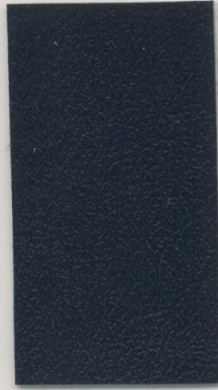
MIDNIGHT BLUE 6163